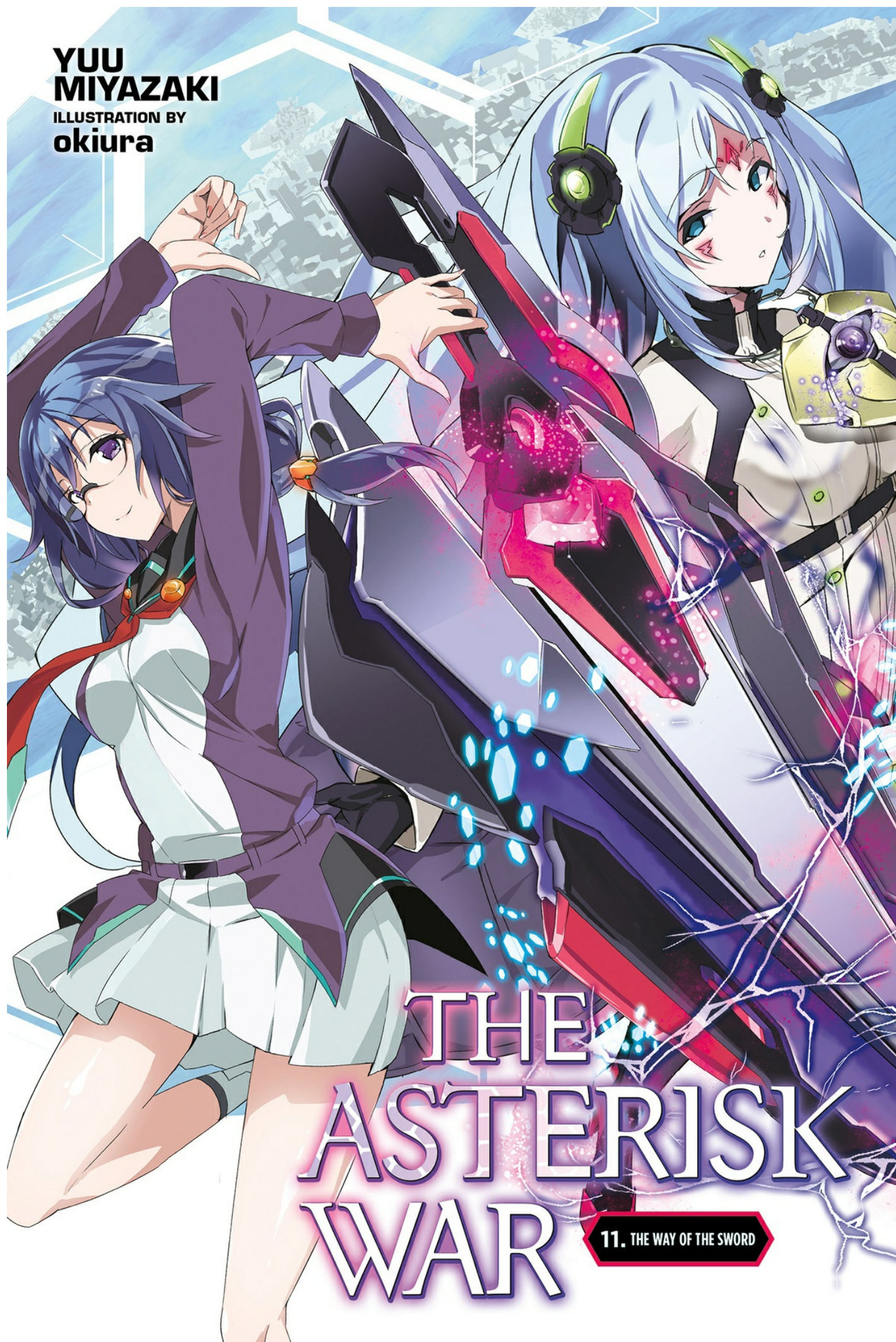
ILLUSTRATION BY okiura